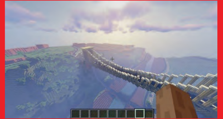
Clifton Suspension Bridge

The accompanying resource pack takes a digital, play-based approach to support children to develop their own ideas and problem-solving skills. It encourages them to engage with engineering as a creative and diverse subject that can impact the world around them. The lessons use the Minecraft world as the setting for children to explore, build, re-design and re-engineer the city around them.