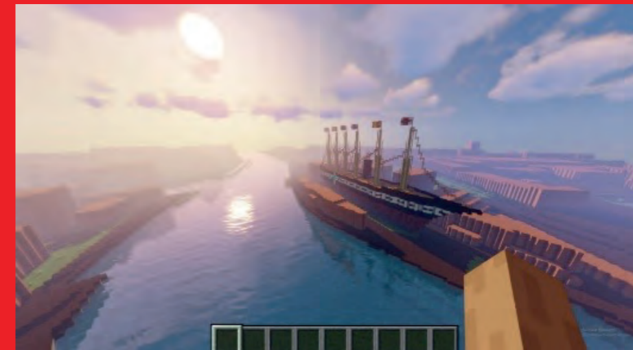
Bristol Harbour and the SS Great Britain